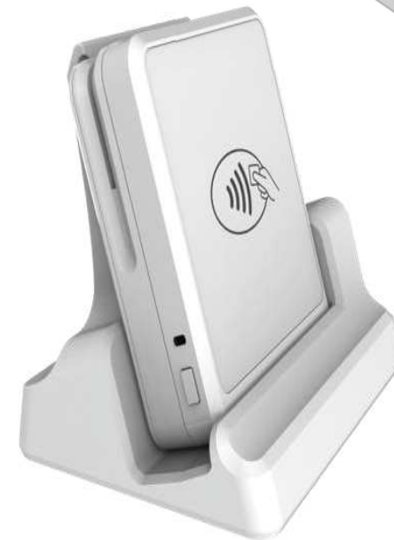
Re-designed Reader and Stand